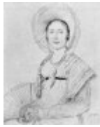
"Lady with Fan" by Ingres.