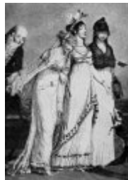
This French fashion plate shows the decided classical Grecian influence upon Regency fashion. Note the trimming on the overskirt in the center and the hairstyles on the ladies.