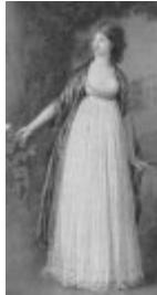
Painting of Queen Luise.