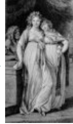
Queen Luise and her sister, Frederika.