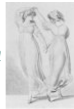
Two sisters dancing. Note the clinging nature of the gowns. Very French!